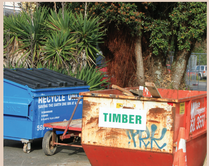
A couple of the recycling bins at BRANZ that are used to separate construction waste.